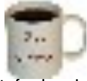
at start of each session

Stratified Open Pairs (single session) Silver points (1500, 2500, unlimited) Thursday, Friday 9:30 a.m. & 2:00 p.m.