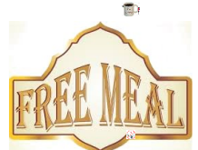
following morning session

SWISS TEAMS (two sessions) Gold Rush Red/Gold (200, 500, 750) Saturday 9:30 a.m. & 2:00 p.m.